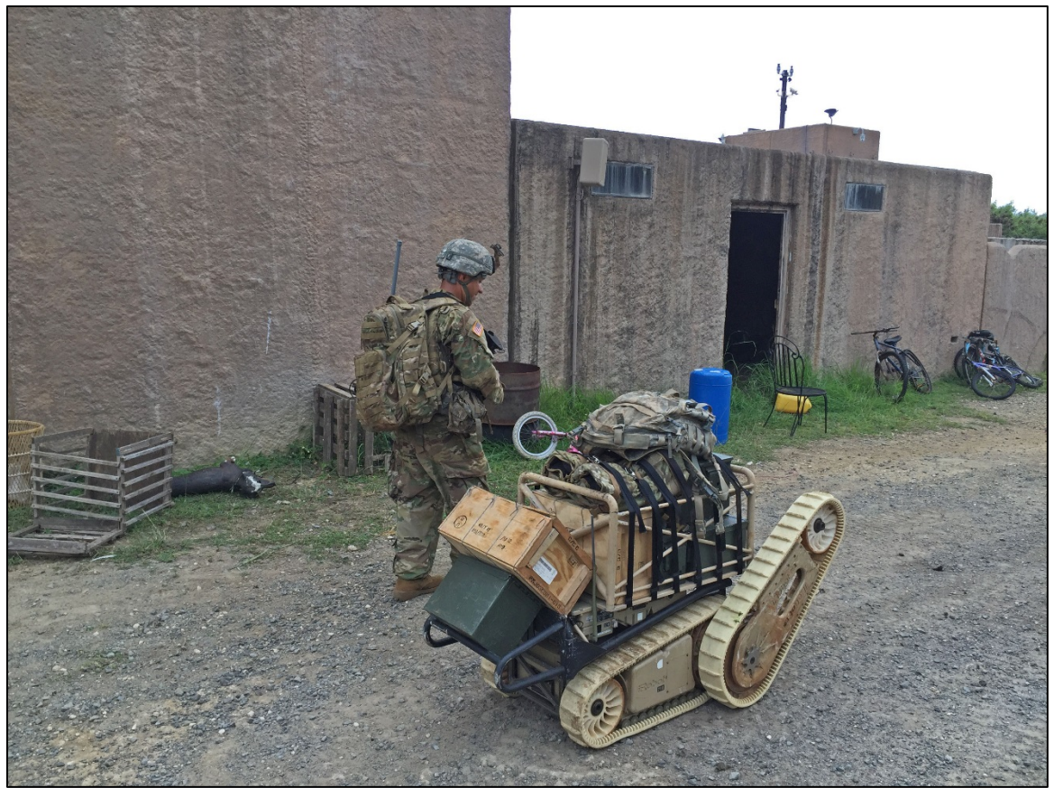
FIGURE 2: SOLDIER AND LOAD CARRYING ROBOT

of new and exciting possibilities.<sup>93</sup> These will enrich society but profoundly challenge how military organizations think about the profession of arms.