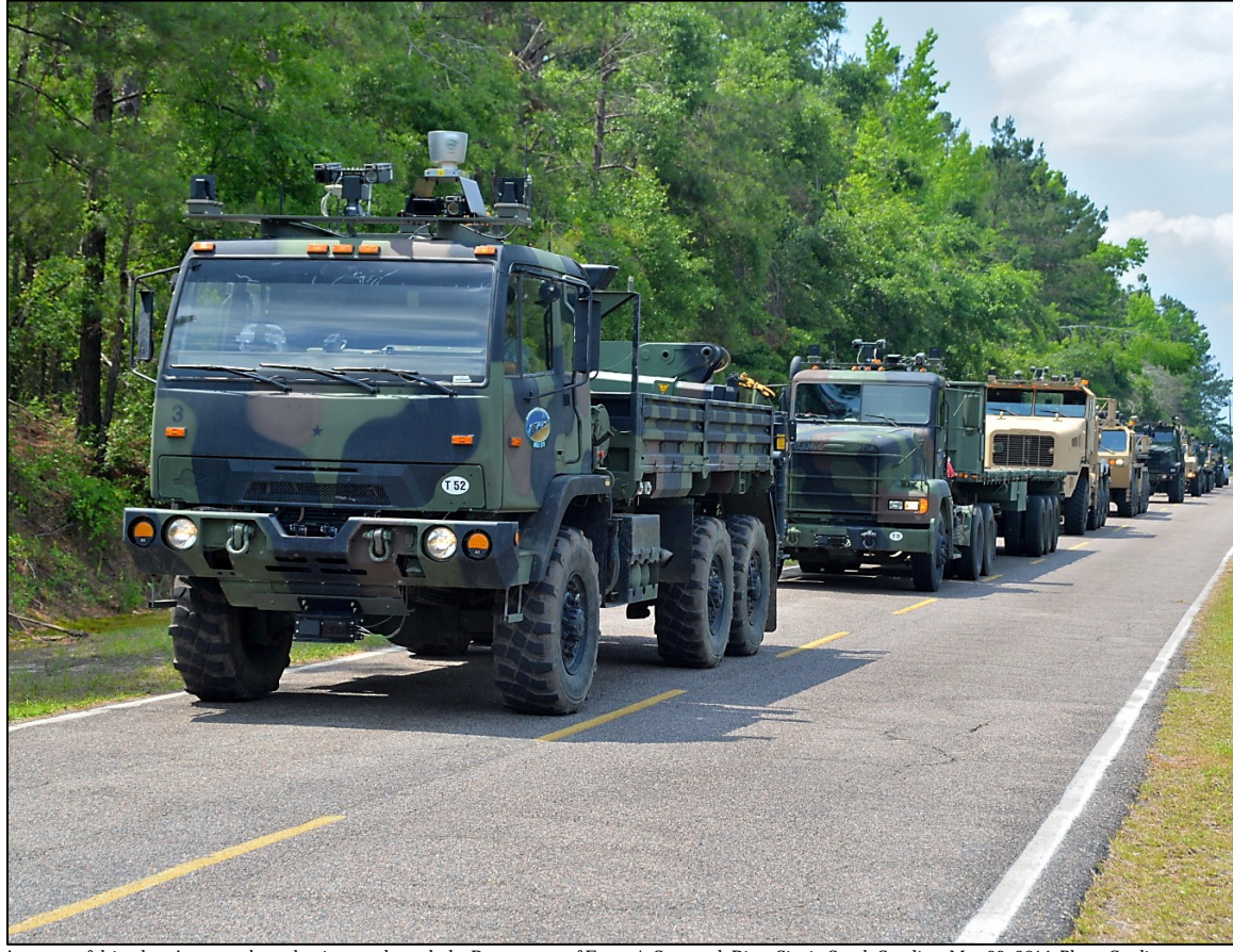
FIGURE 1: AUTONOMOUS TRUCK CONVOY